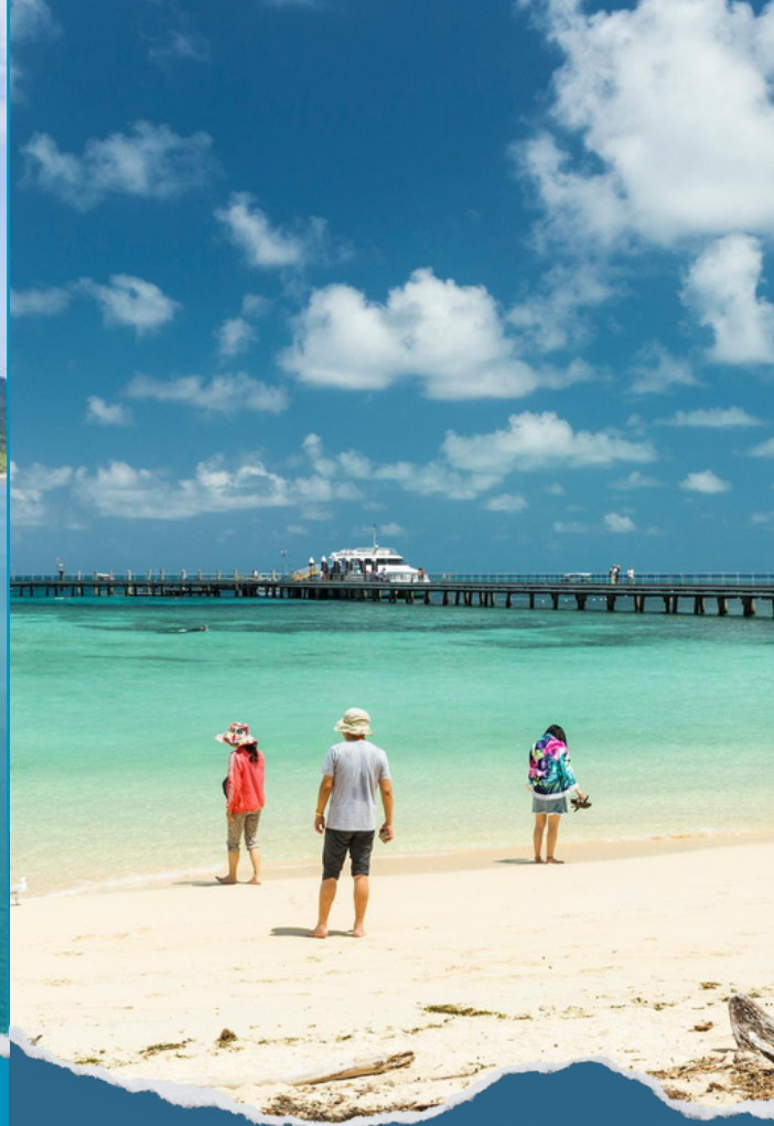
CAIRNS NORTHERN BEACHES