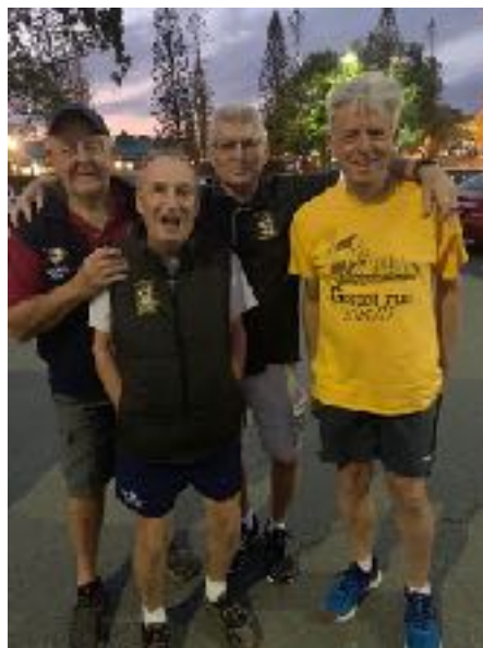
These are some happy Runners