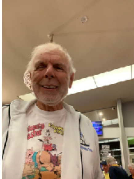
This is Sir Slab