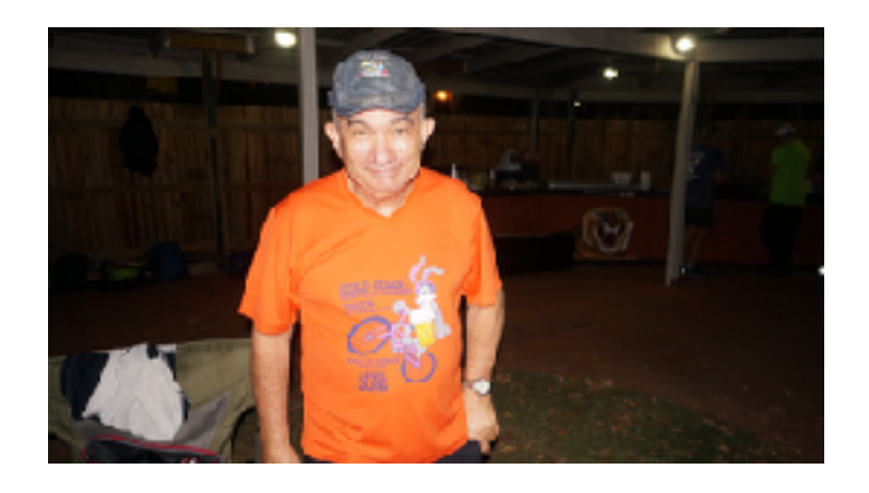
Good to see you back BlueCard