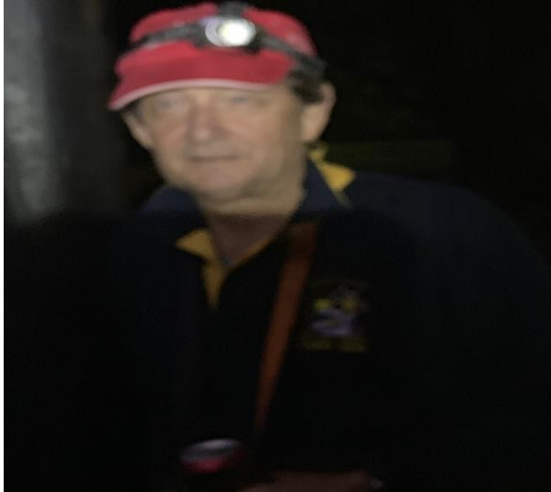
Worried by weather!