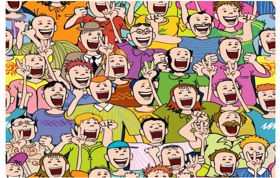
Asked to Rate the Run, the crowd went wild

Unbelievable scenes in the circle when asked to rate the run ... the ecstatic Hashers went wild, clapping, cheering, throwing caps in the air. The Hare, Shat, was so pleased and proud.