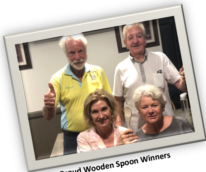
Proud Wooden Spoon Winners