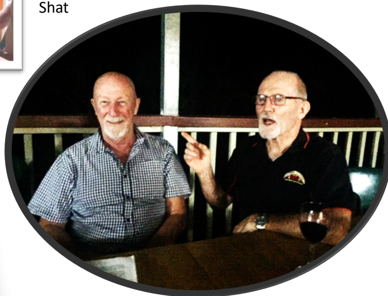
Truck Tyre & Badger. Brothers ?