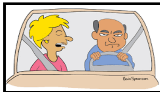
Hash Rally Driving ... ... a lovely way for couples to bond, eh