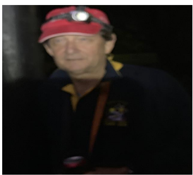
Worried by weather!