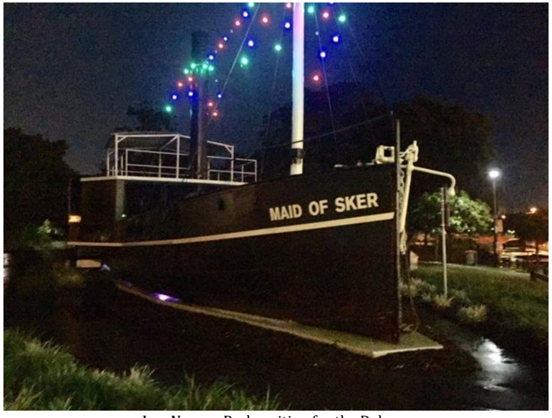
In a Nerang Park waiting for the Deluge.